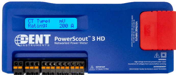
DIN Rail Enclosure Pictured (PS3HD-R-D-N). Wall Mount Enclosure (PS3HD-C-D-N) is also available.